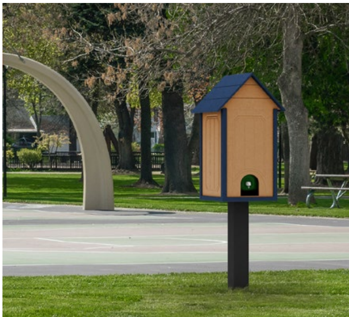
Terra Water Cooler Enclosure