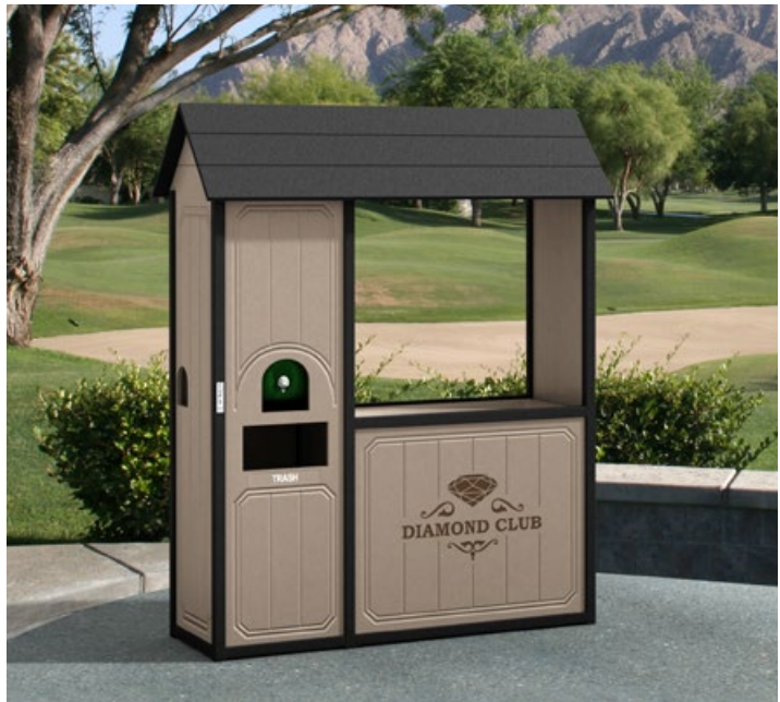
Terra Water Cooler Center