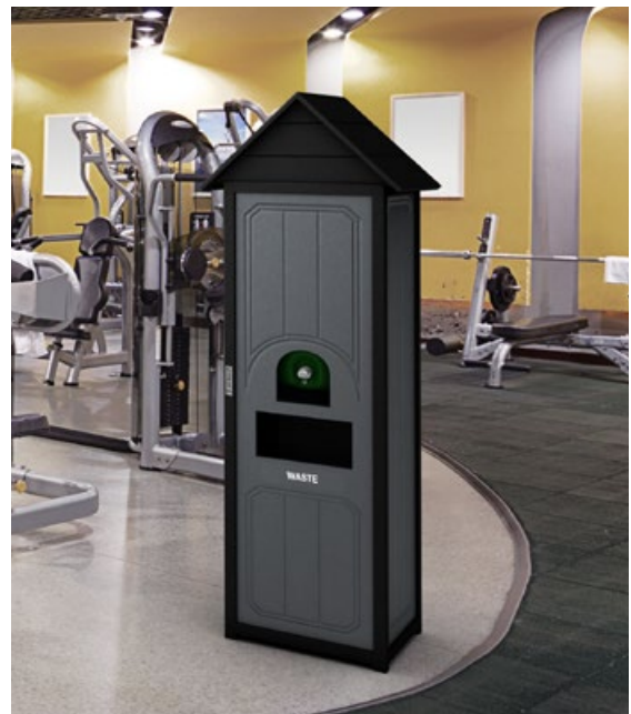
Terra Water Cooler Station