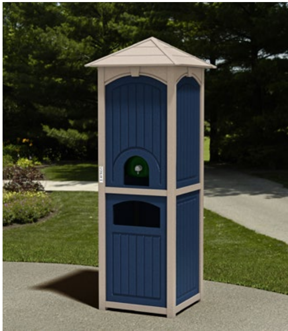
Verde Water Cooler Station

A Max-R Water Cooler Enclosure, Station or Center provides a self-service option for guests to retrieve ice and water when they need it. Supporting a 10-gallon Igloo® Cooler (sold separately), Max-R Water Coolers also come standard with an internal cup dispenser.