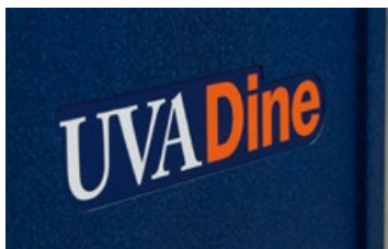
ADD YOUR LOGO