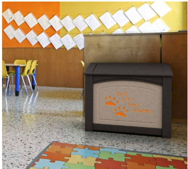
Verde Medium Storage Container with Angled Top