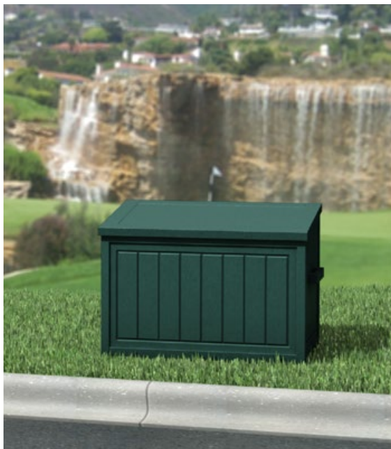
Terra Medium Storage Container with Angled Top