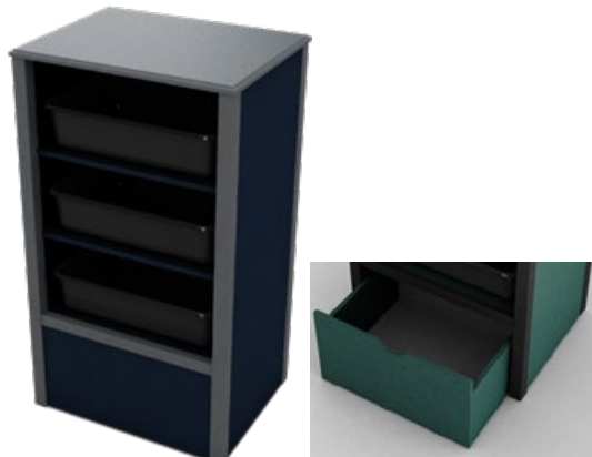
Three Shelves with Storage Drawer