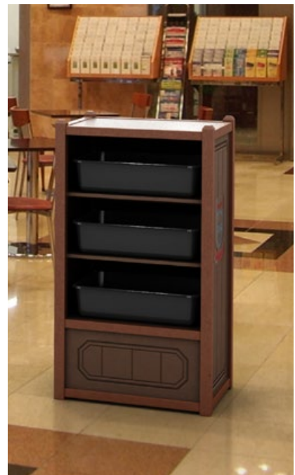
Terra Busser Station