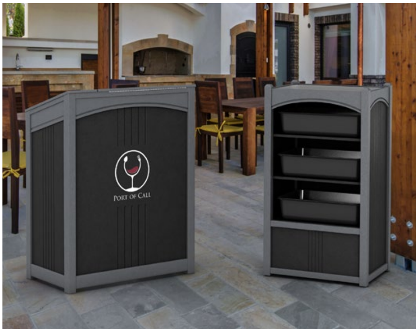
Verde Busser Station shown with Medium Hostess Station