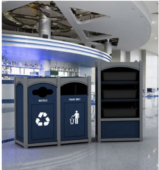
Verde Busser Station shown with Double Waste & Recycling Bin