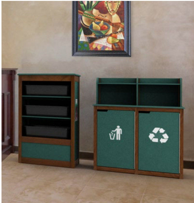
Tuscany Busser Station shown with Double Waste & Recycling Bin

A Max-R Busser Station provides an area to store used dishes and allows for easy clean up of your dining area.