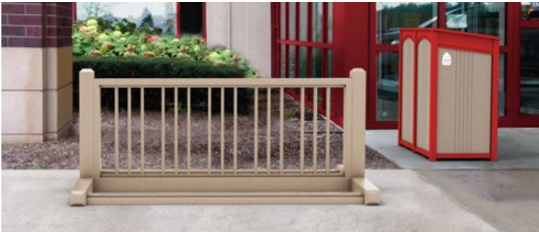
Terra 10 Bike Rack