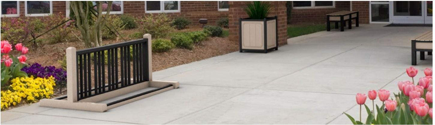
Terra 10 Bike Rack

A Max-R Bike Rack not only provides a central location for bike parking, but won't rot, rust, or fade and can be customized to match your facility's aesthetics and design standards.