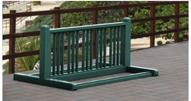
Terra 10 Bike Rack