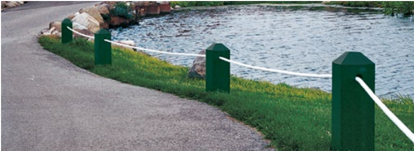
Cart Barrier Bevel Top with Hole

Keep visitors on the desired path with our subtle, yet effective cart barriers and rope posts. Made from our maintenance-free Max-R Lumber™ and available in multiple sizes / lengths, customize the barrier or rope post to your specific need.