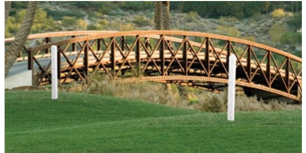
Rope Post Bevel Top