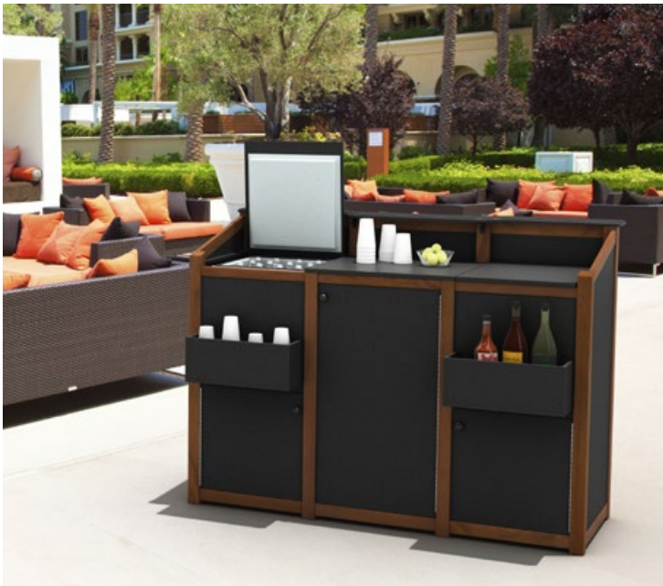
Tuscany Bar Station

A Max-R Bar Station provides a convenient and portable service station to provide guests beverage service, order from menus, and check-in for reservations. Provide your hostesses, and bartenders quick convenient access to serve guests efficiently.