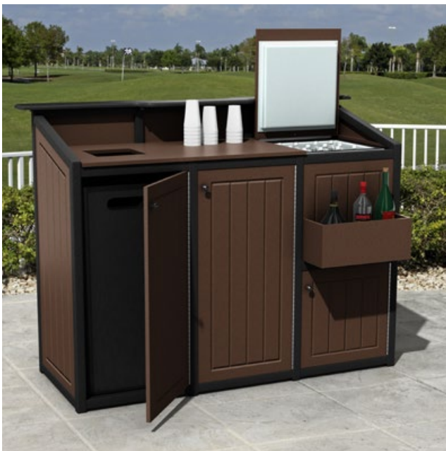
Terra Bar Station