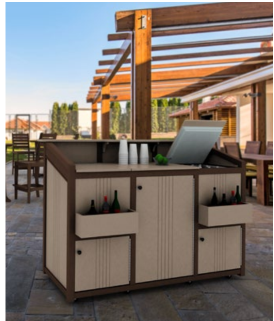
Verde Bar Station