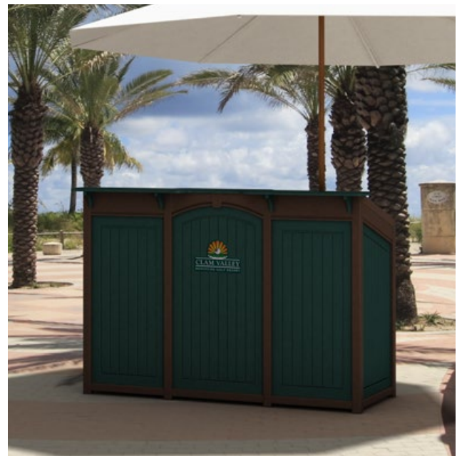
Verde Bar Station