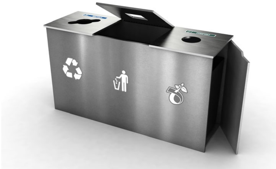
Triple 32 Gallon with side doors and middle hinged top

The Royal Collection is recognized by its brushed aluminum panels and a stainless steel top. Available in small gallon capacities with a hinged top and larger gallon capacities with door access, customize the Royal Collection to your waste streams and capacity needs.