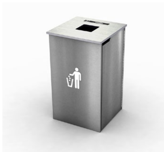
Single 32 Gallon with side door