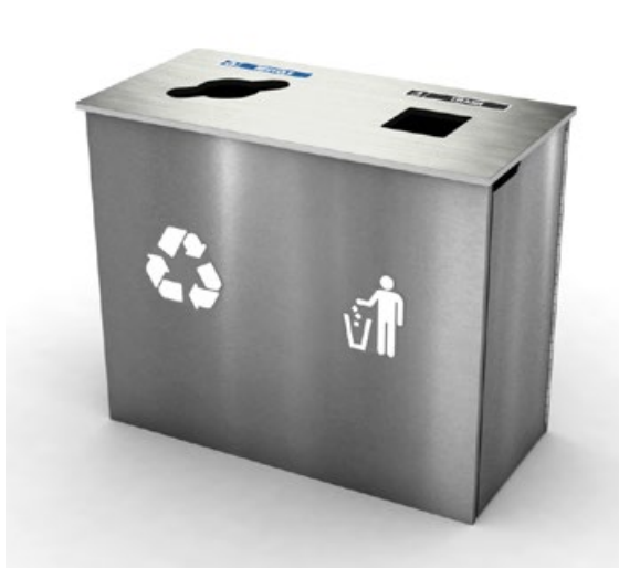
Double 32 Gallon with side doors