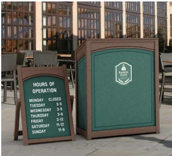
Verde Medium Hostess Station