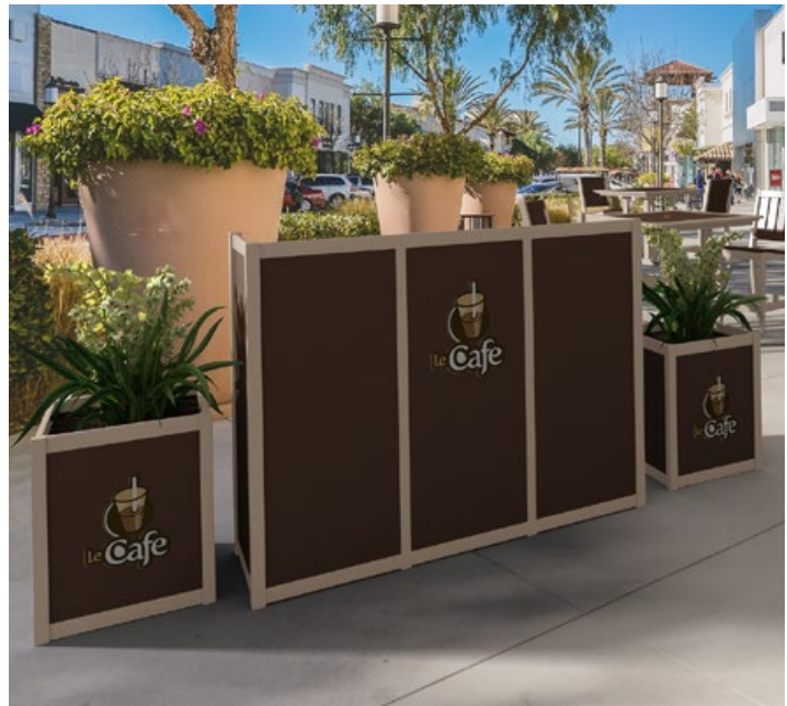
Terra Large Hostess Station