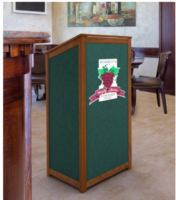
Tuscany Small Hostess Station