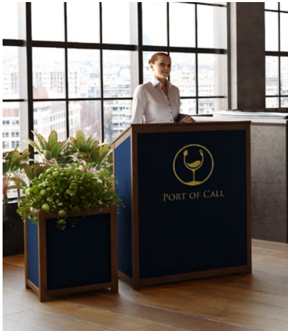
Tuscany Medium Hostess Station

First impressions matter. A Max-R Hostess Station provides an area to greet guests or as a central location for staff. It comes standard with a hinged door to allow for out-of-sight storage or a place to keep for valet keys.